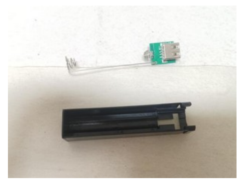
Step 1 Put the green color connector into the black box.

The following is the detail steps how to assembly/ disassembly our powerbank with battery: